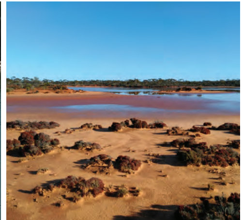
Remote WA - near Kalgoorlie Vikki Rosagro