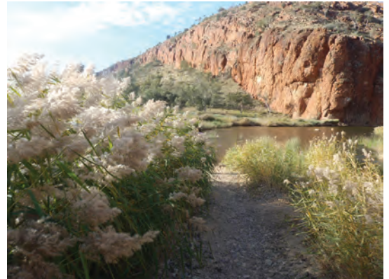
Alice Springs & McDonnell Ranges