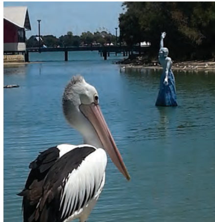
Pelican and statue - Mandurah Lynne Finlay